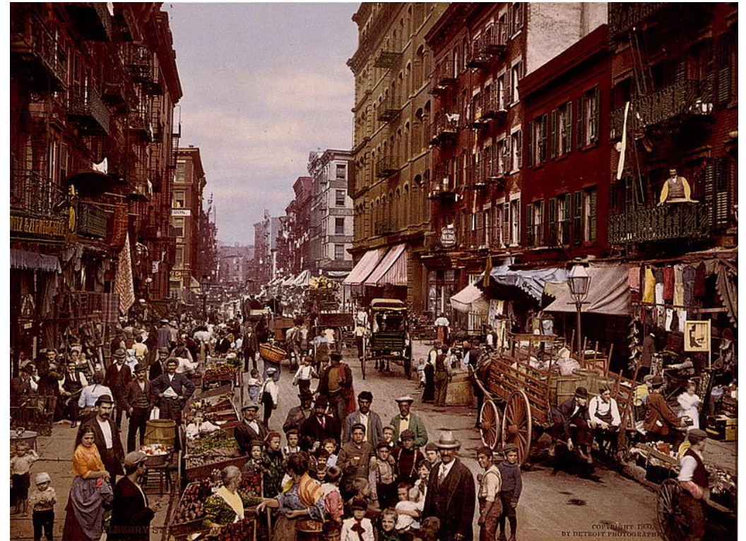
Mulberry Street, New York City (1900)