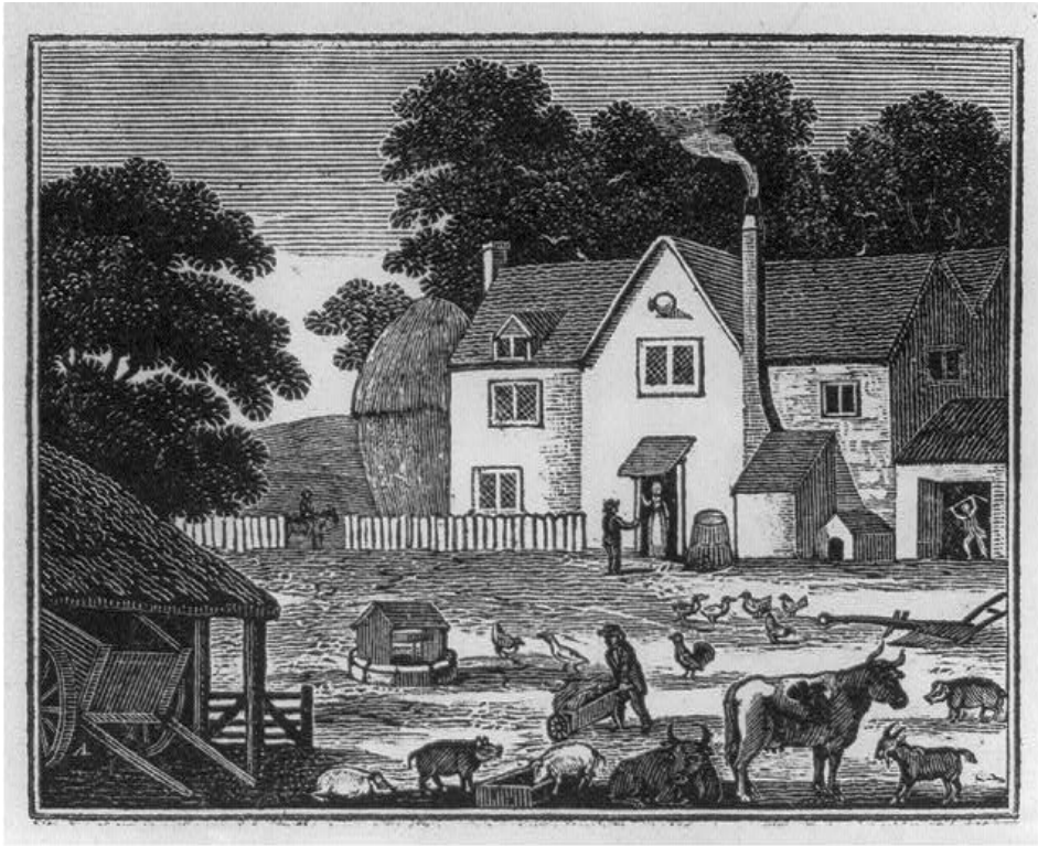
Farm Scene showing house, animals, people working (1800s)