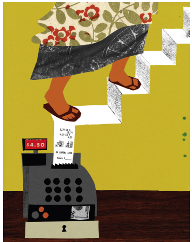
Illustration by Justin Renteria

Recent news coverage of Hot Bread Kitchen reads as if it were written about two different organizations. The New York City bakery is widely acclaimed for its innovative selection of international breads, but it is simultaneously an award-winning workforce development program. Hot Bread Kitchen is a hybrid organization: Its employees, mostly low-income immigrant women, bake bread inspired by their countries of origin, while learning job skills that can lead them to management positions in the food industry. In this way, Hot Bread Kitchen combines two traditionally separate models: a social welfare model that guides its workforce development mission and a revenue generation model that guides its commercial activities.